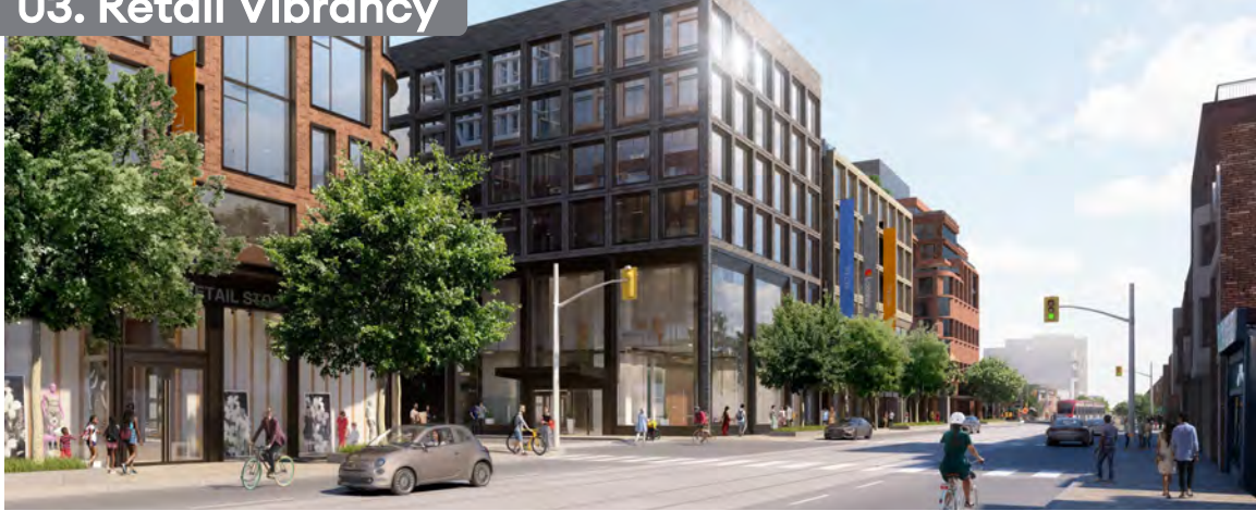
03. Retail Vibrancy