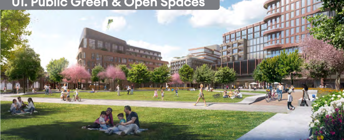
01. Public Green & Open Spaces