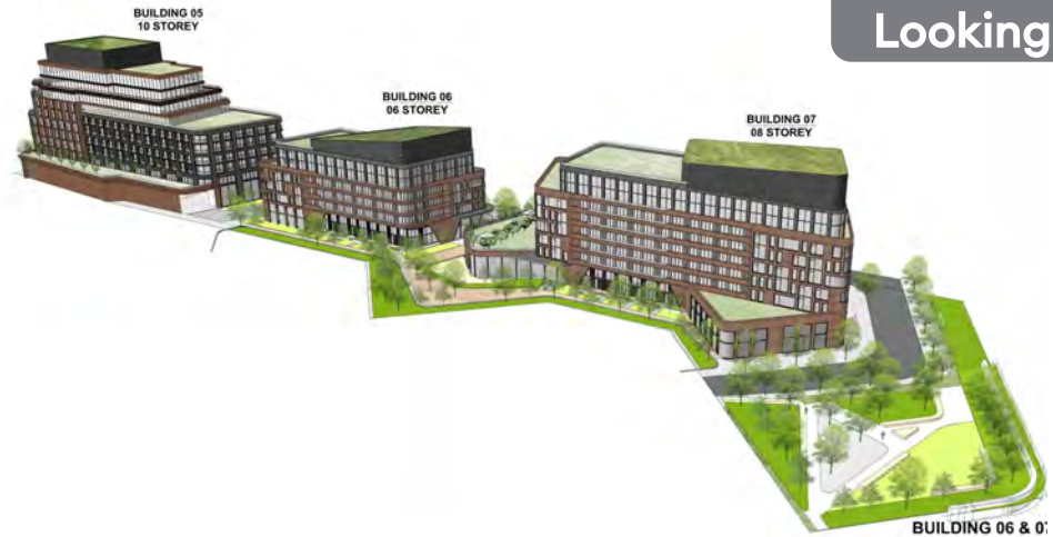
Building 06 & 07 Looking North West