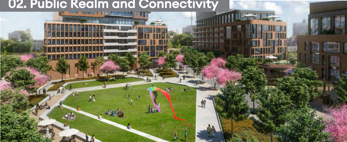
02. Public Realm and Connectivity