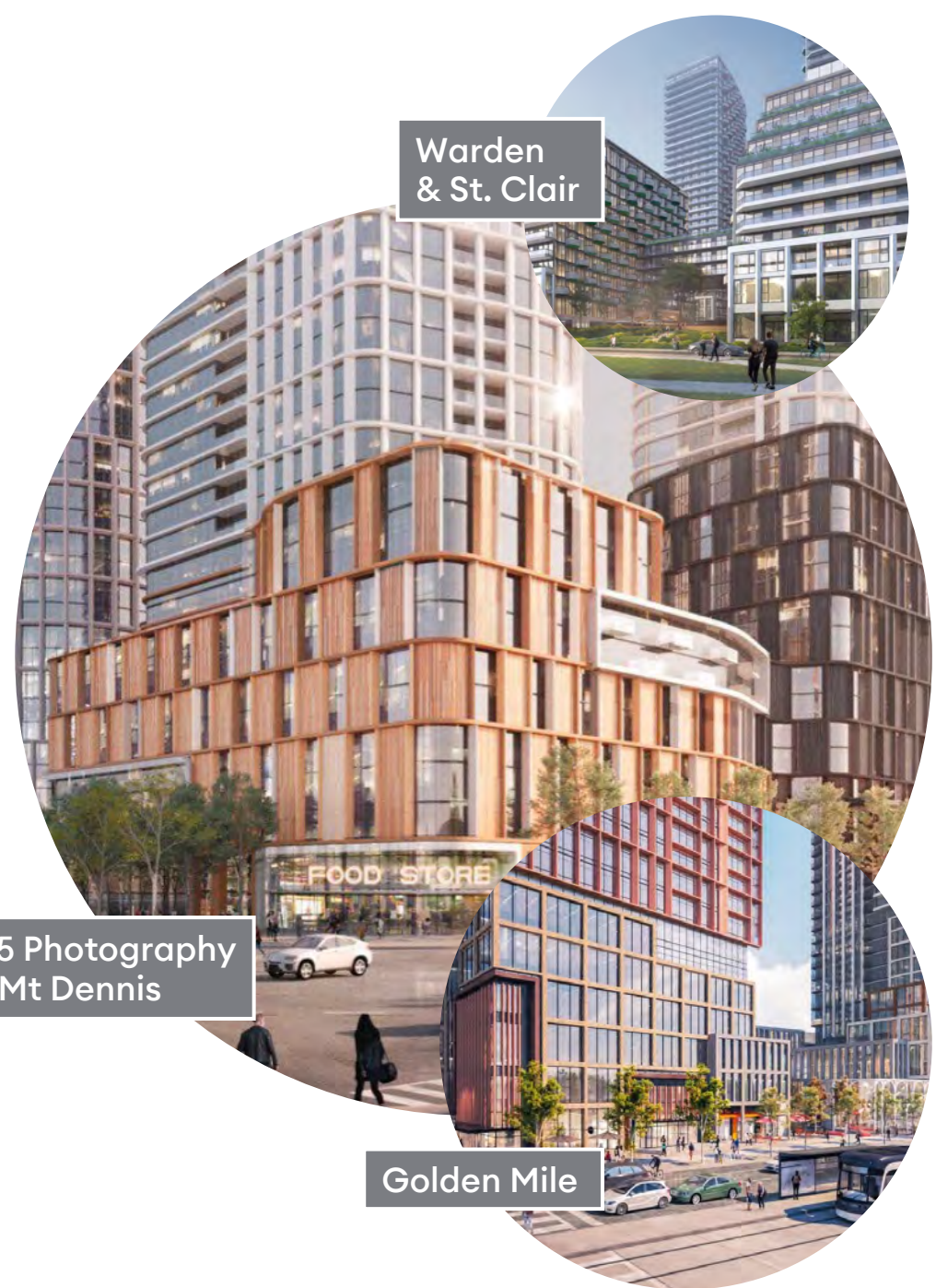
Warden & St. Clair

Presented Live during Virtual Update Meeting, July 14, 2022. All renderings and images are conceptual and for presentation purposes.