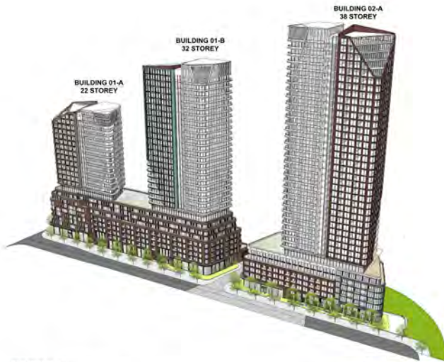
Building 01 & 02 Looking North West