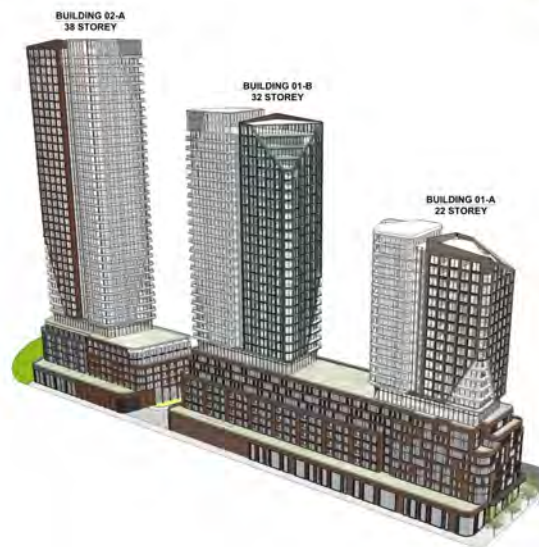
Building 01 & 02 Looking South East