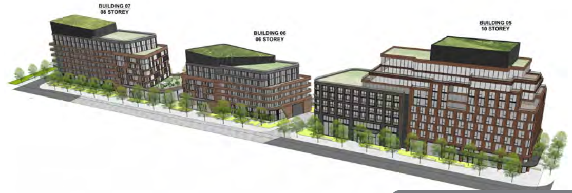
Building 06 & 07 Looking South East